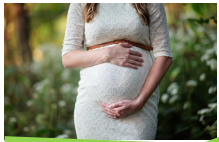
Daily Devotional for Pregnant Women

Published by Yes Lord Publication www.oakofrighteousness.co.uk